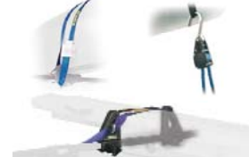
Thule® Load Stops with Tie-downs