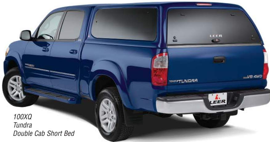
100XQ Tundra Double Cab Short Bed