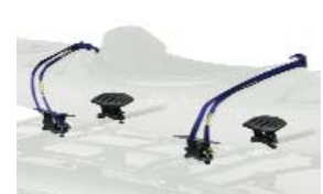
Thule® Top Deck with Tie-downs