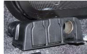
3-Outlet 12V Powerblock