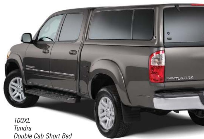
100XL Tundra Double Cab Short Bed

Cap World is Your Authorized LEER Dealer