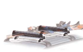
Thule® Flat Top*