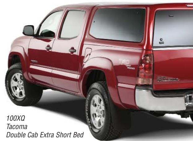
100XQ Tacoma Double Cab Extra Short Bed