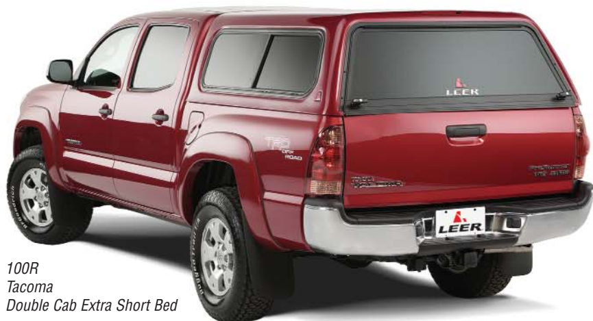
100R Tacoma Double Cab Extra Short Bed

offers great value and good looks with or featuring double T-handle locks and