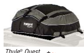
Thule® Quest Bag