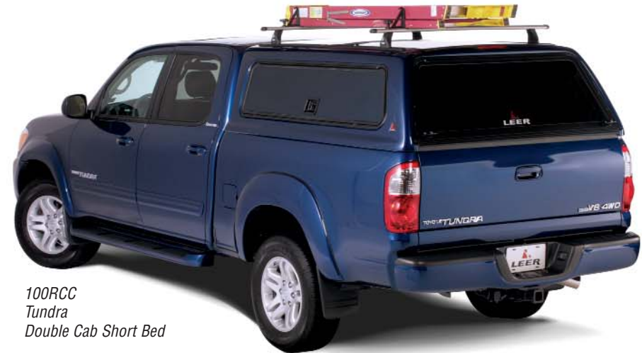
100RCC Tundra Double Cab Short Bed

Cap World is Your Authorized LEER Dealer