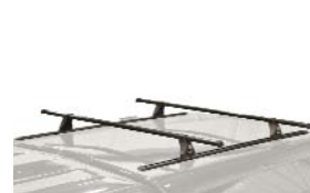
Thule® Tracker II Roof Rack with Locks