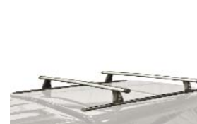
Thule® Aero Bar Roof Rack with Locks