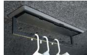
Fold-down Clothes Hanger