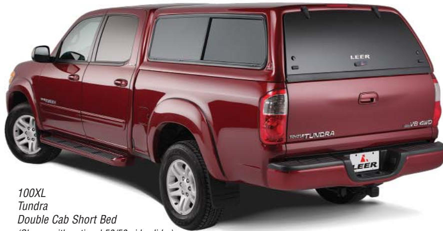
100XL Tundra Double Cab Short Bed (Shown with optional 50/50 side slider)