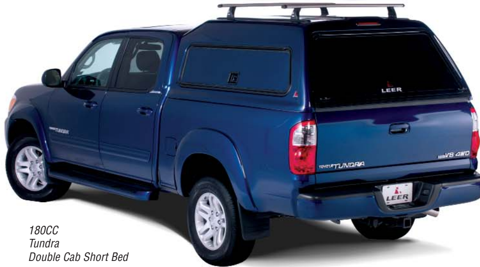
180CC Tundra Double Cab Short Bed

Driven to WORK! This commercial version of our 180 is reinforced for LEER commercial roof racks, offers optional fiberglass side doors, tool box options and more.