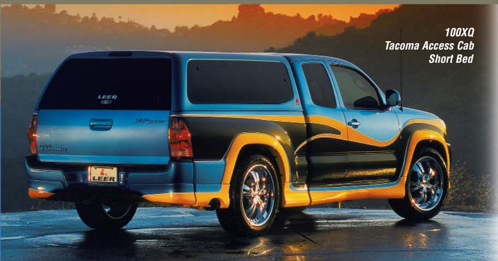
100XQ Tacoma Access Cab Short Bed

More trucks are driven to adventure with LEER caps than any other brand. Great looking LEER caps secure cargo so you can stow and go with the best combination of style, function, value and fit! Aerodynamically engineered LEER caps integrate cleanly with the body lines of your truck. Choose from the widest selection of options in the industry to fit today's active lifestyles.