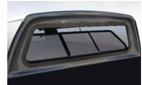
Removable Front Slider