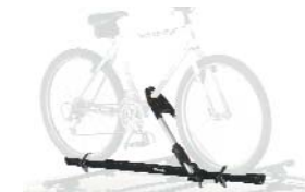
Thule® Big Mouth