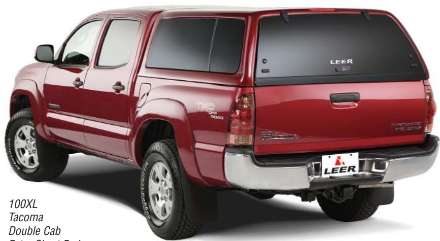
100XL Tacoma Double Cab Extra Short Bed

Sleek SUV style with frameless curved rear door, LEER twist handle, rotary latches, sleek tinted side windows with twist-out vents with screens, and recessed LED third brake light.