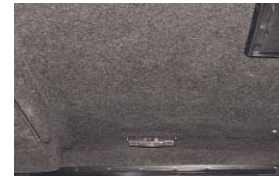
Interior Carpet Headliner