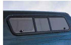
Side Window Slider