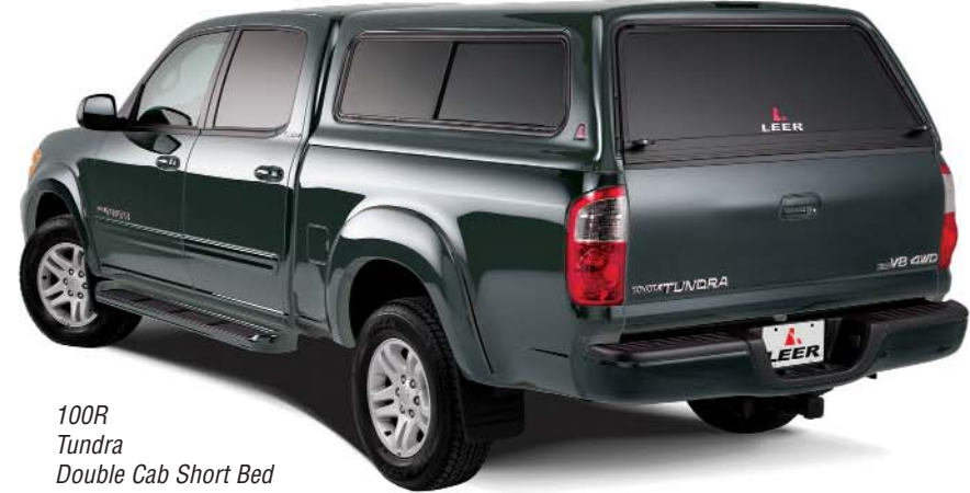
100R Tundra Double Cab Short Bed