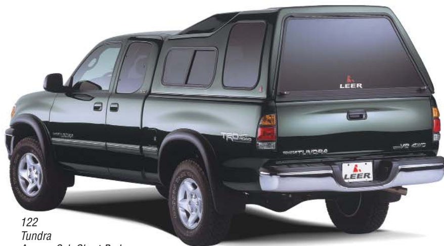
122 Tundra Access Cab Short Bed

Maximize cargo space! LEER's famous high-rise profile features an oversized rear door with double T-handle locks and comes complete with large bay windows and screened, sliding windows.