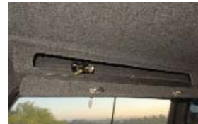
Locking Overhead Storage Box