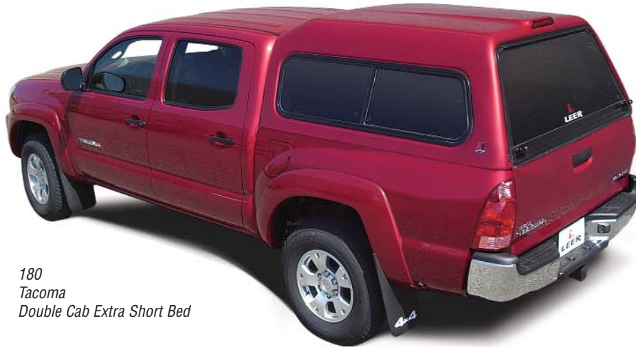
180 Tacoma Double Cab Extra Short Bed

Haul loads of cargo with this mid-rise cap. Increased ceiling height adds 20% more interior room than cab-high models. The 180 includes 50/50 side windows with screens, a recessed LED third brake light, full-height framed rear door and two T-handle locks.