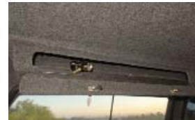
Locking Overhead Storage Box