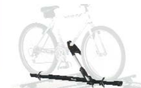
Thule® Big Mouth