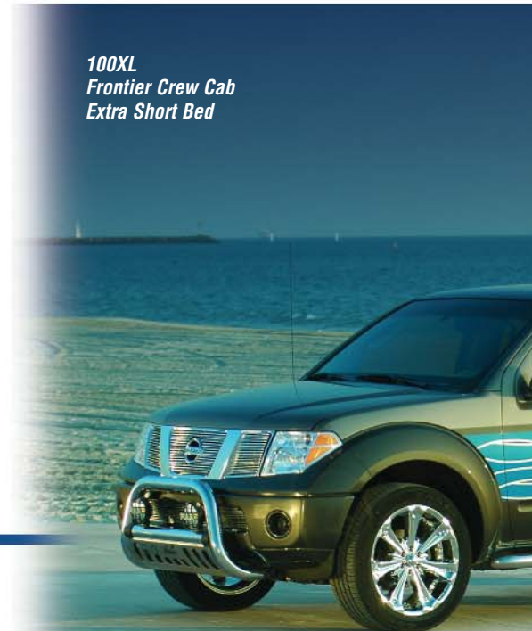
100XL Frontier Crew Cab Extra Short Bed