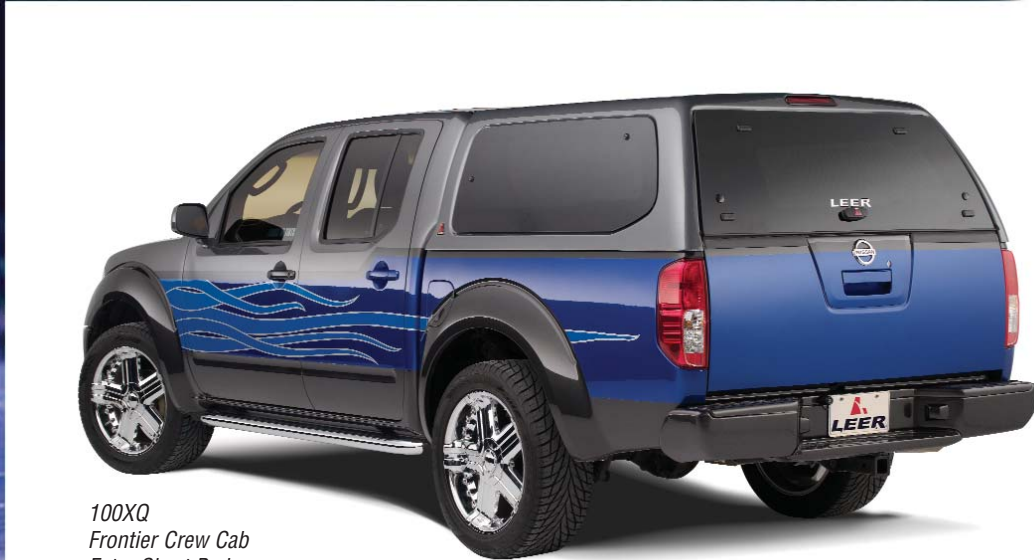
100XQ Frontier Crew Cab Extra Short Bed