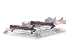
Thule® Flat Top*