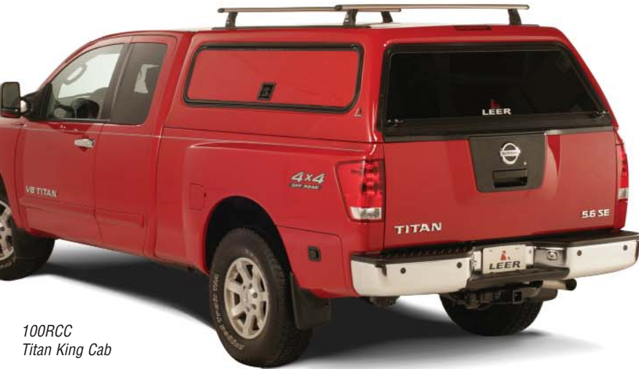
100RCC Titan King Cab

The commercial version of our 100R is a secure workshop. The 100RCC is reinforced for LEER commercial roof racks, offers an optional fiberglass side door, tool box options and more.