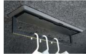
Fold-down Clothes Hanger