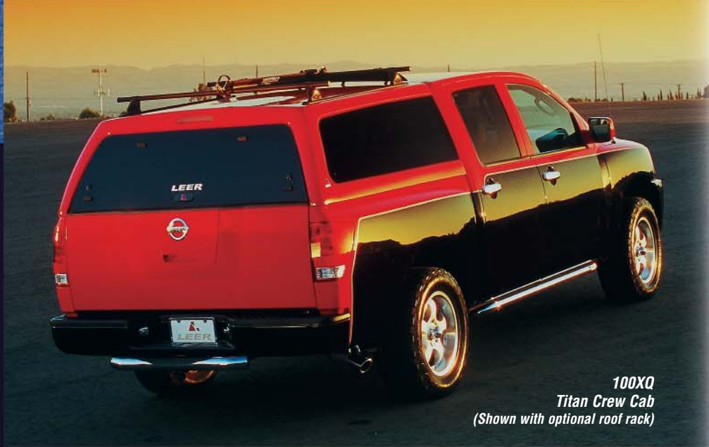
100XQ Titan Crew Cab (Shown with optional roof rack)