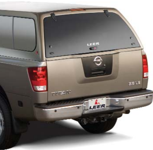
100R Titan King Cab

Safely secure your cargo and set off for adventure. The 100R offers great value and good looks with screened 50/50 recessed sliding windows, a recessed rear door featuring double T-handle locks and recessed third brake light.