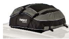
Thule® Quest Bag