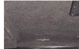
Interior Carpet Headliner