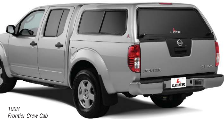
100R Frontier Crew Cab Extra Short Bed