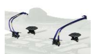
Thule® Top Deck with Tie-downs