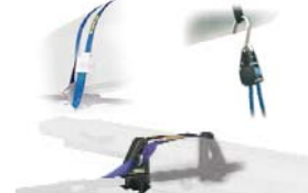
Thule® Load Stops with Tie-downs