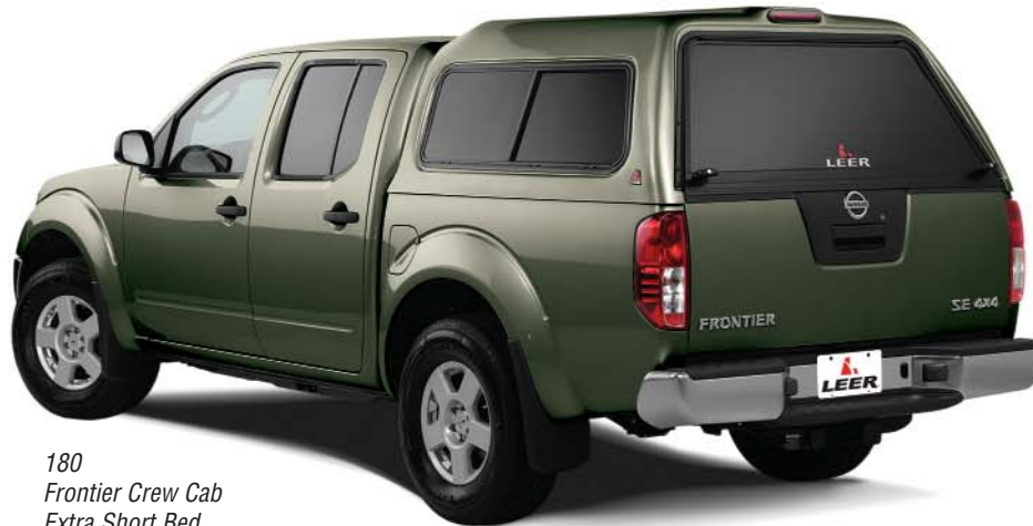
180 Frontier Crew Cab Extra Short Bed

180 Haul loads of cargo with this mid-rise cap. Increased ceiling height adds 20% more interior room than cab-high models. The 180 includes 50/50 side windows with screens, a recessed LED third brake light, full-height framed rear door and two T-handle locks.