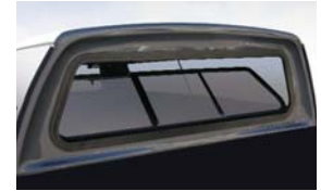
Removable Front Slider