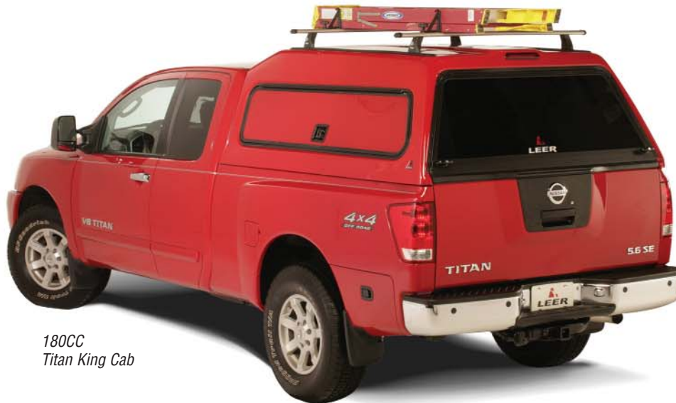
180CC Titan King Cab

Driven to WORK! This commercial version of our 180 is reinforced for LEER commercial roof racks, offers optional fiberglass side doors, tool box options and more.