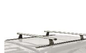
Thule® Aero Bar Roof Rack with Locks