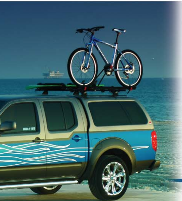
100R Titan Crew Cab (Shown with optional roof rack)