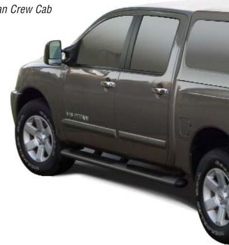
100XL Titan Crew Cab