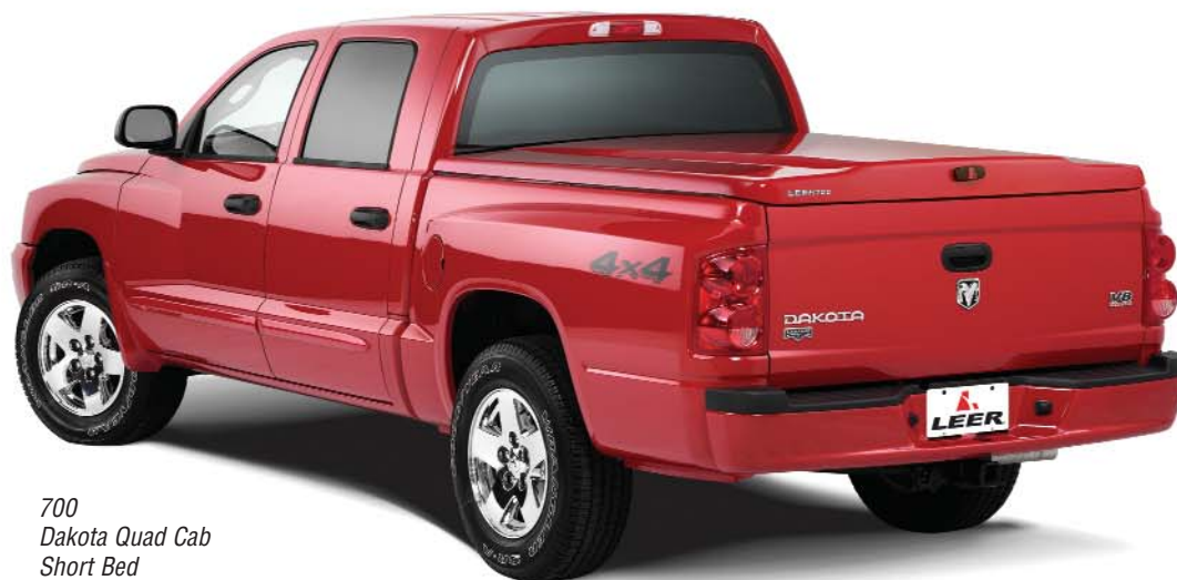
700 Dakota Quad Cab Short Bed