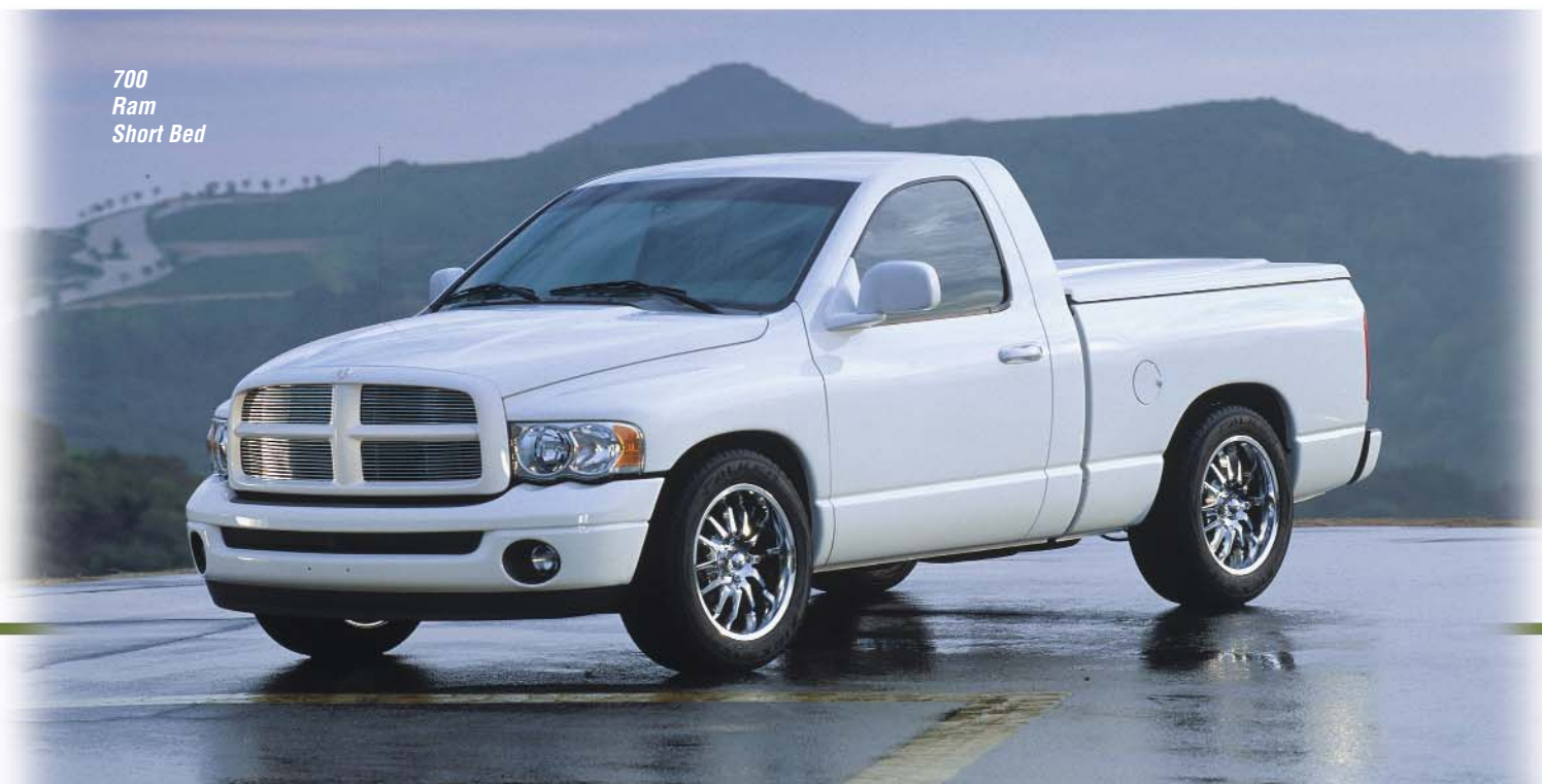
700 Ram Short Bed