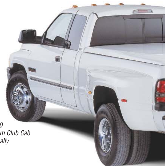
700 Ram Club Cab Dually