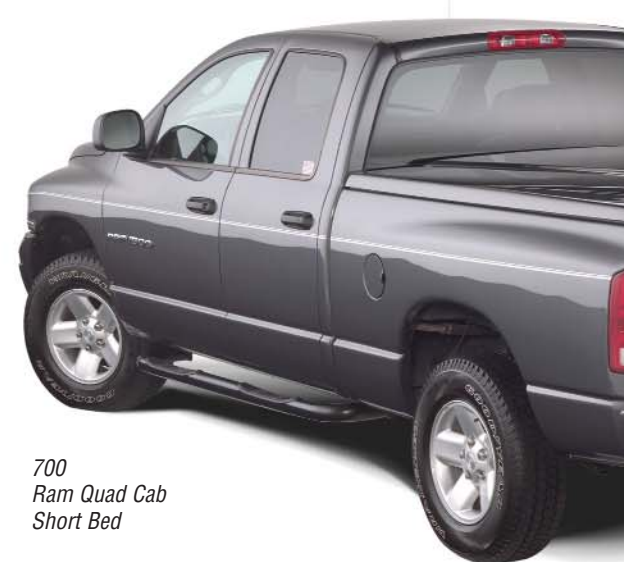
700 Ram Quad Cab Short Bed