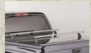
Thule® Aero Bar Roof Rack