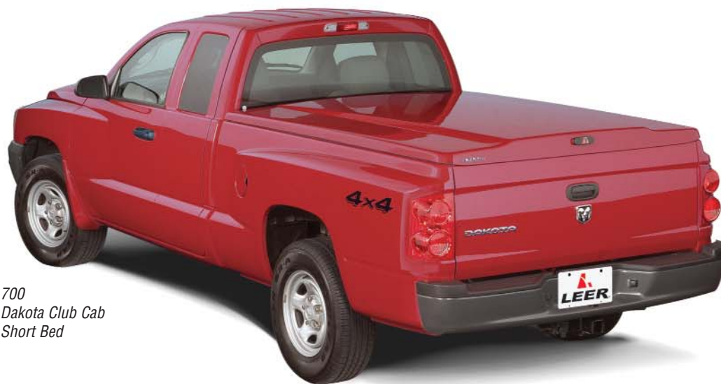
700 Dakota Club Cab Short Bed