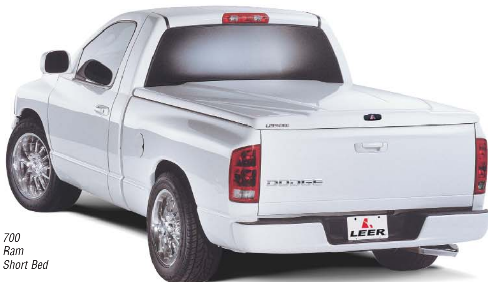
700 Ram Short Bed

700 The 700's high dimension design integrates smoothly with your truck's body lines for a stylish custom-fit. A LEER twist handle and automotive style rotary latches secure your cargo.