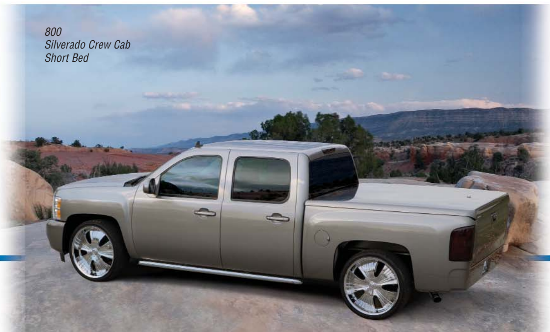
800 Silverado Crew Cab Short Bed