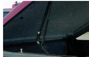
Super Lift System