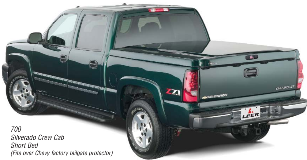
700 Silverado Crew Cab Short Bed (Fits over Chevy factory tailgate protector)