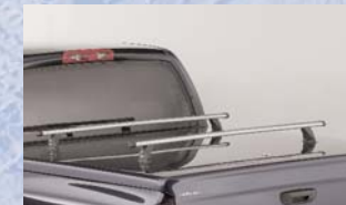
Thule® Aero Bar Roof Rack