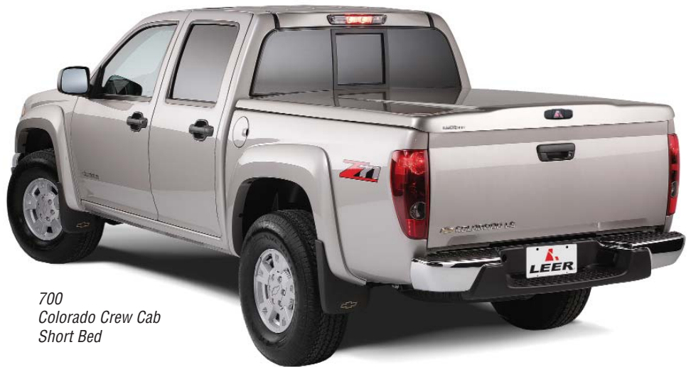
700 Colorado Crew Cab Short Bed