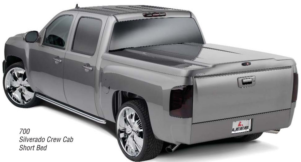
700 Silverado Crew Cab Short Bed