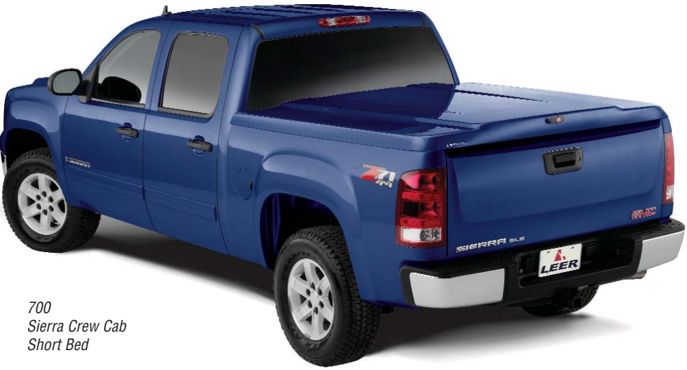
700 Sierra Crew Cab Short Bed

700 The 700's high dimension design integrates smoothly with your truck's body lines for a stylish custom-fit. A LEER twist handle and automotive style rotary latches secure your cargo.