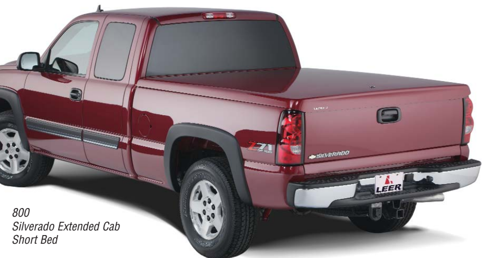
800 Silverado Extended Cab Short Bed