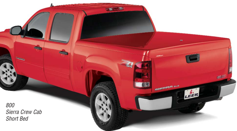
800 Sierra Crew Cab Short Bed