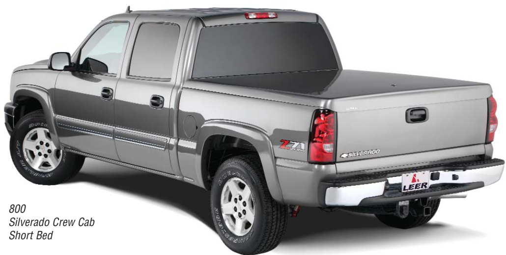
800 Silverado Crew Cab Short Bed